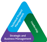
PMI Talent Triangle

PMP® CAPM® PgMP® PfMP® PMI-ACP® PMI-PBA® PMI-RMP® PMI-SP®